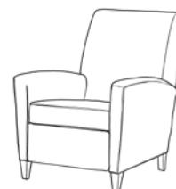
Biddeford Power Recliner