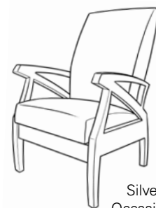
Silverthorne Occasional Chair