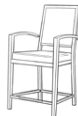
Galveston Counter-Height Stool