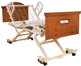
Roll at Any Height shown