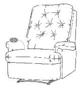
Hattiesburg Power Lift Recliner