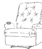
Hattiesburg Power Recliner