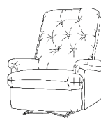
Hattiesburg Rocker Recliner