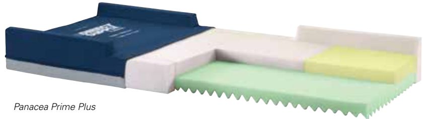
Panacea Prime Plus

This mattress may be appropriate for stage I or II pressure wounds.*