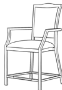
Macon Counter-Height Stool