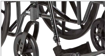
Tool-free adjustments on legrests