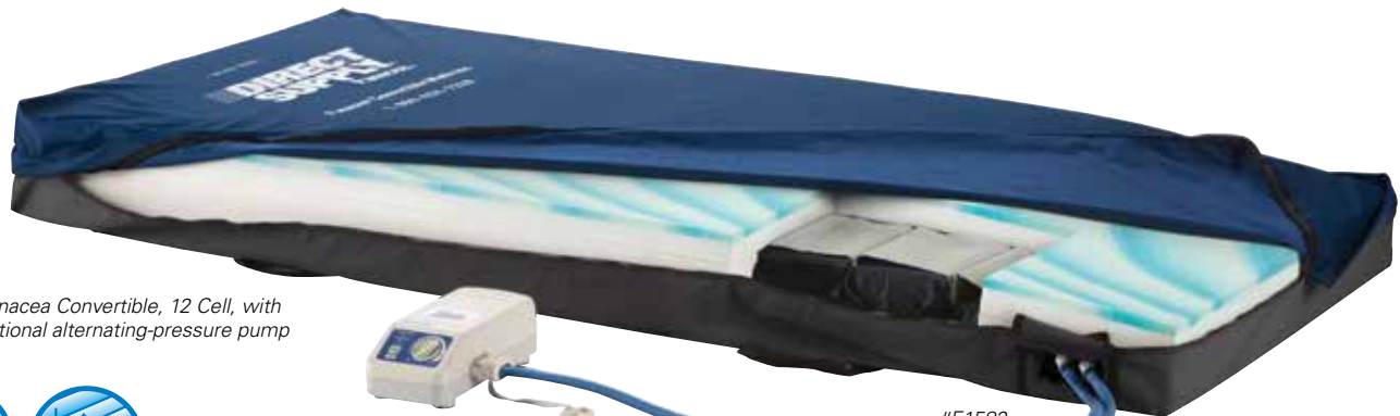
Panacea Convertible, 12 Cell, with optional alternating-pressure pump