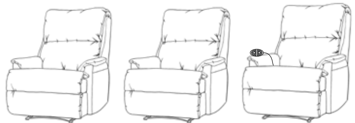
Hazleburst Rocker Recliner