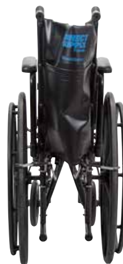
Chair can still be folded with the anti-rollback device installed