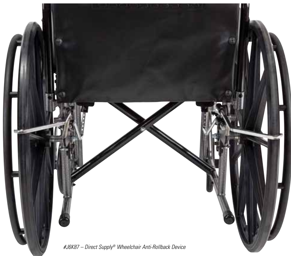
#J6K87 – Direct Supply® Wheelchair Anti-Rollback Device