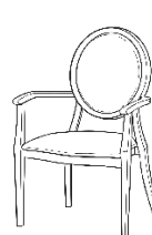
Gainesville Dining Chair