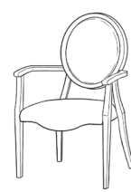
Gainesville Accent Chair