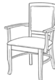
Williamsburg Dining Chair