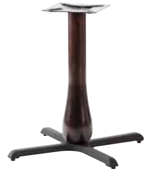
Pedestal Cross Table Bases