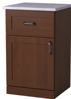
*stone top options available*