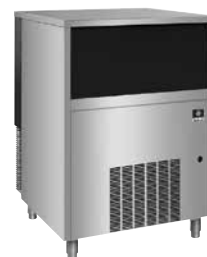
RF-0385 undercounter height