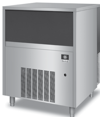
Model RF-0385A* Flake Ice Machine