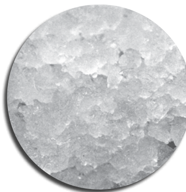
Ice shown actual size