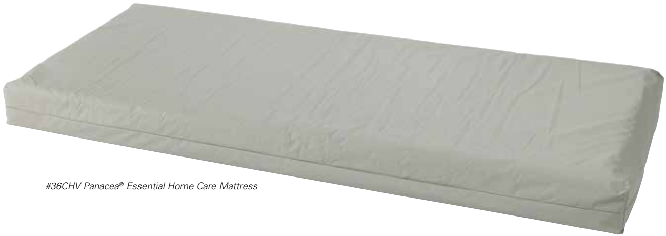
#36CHV Panacea® Essential Home Care Mattress