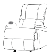
Baxley Power-Lift Recliner