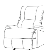
Baxley Rocker Recliner