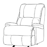
Baxley Manual Recliner