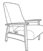
Glen Ellyn Power Recliner