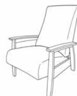
Glen Ellyn Manual Recliner