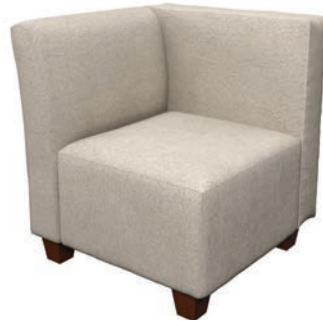
Bartlesville Left Straight Arm One Arm Chair