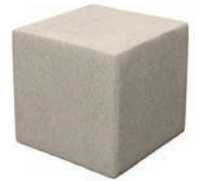
Bartlesville 18" Laminated Ottoman