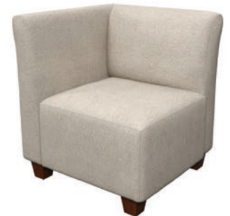
Bartlesville Right Curved Arm One Arm Chair