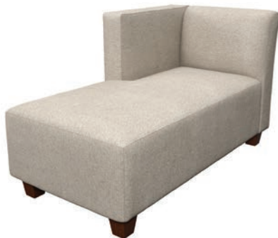
Bartlesville Right Straight Arm Chaise