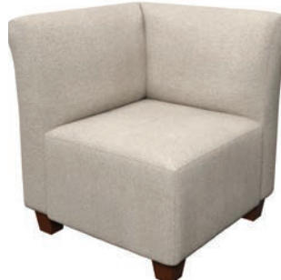
Bartlesville Corner Chair with Curved Arm