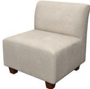
Bartlesville Armless Loveseat