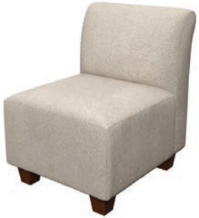
Bartlesville Armless Chair