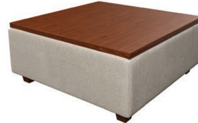
Bartlesville 28" Laminated Ottoman