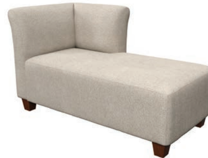
Bartlesville Left Curved Arm Chaise