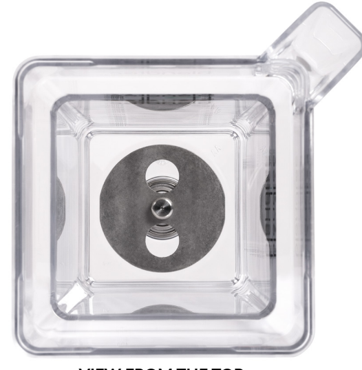
VIEW FROM THE TOP Blendtec's innovative frothing blade