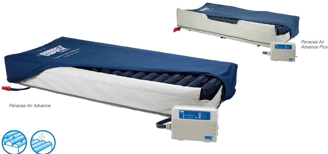
Panacea Air Advance