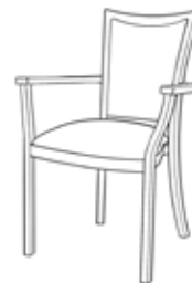
Huntsville Dining Chair