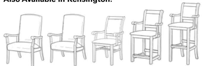
Kensington Occasional Chair