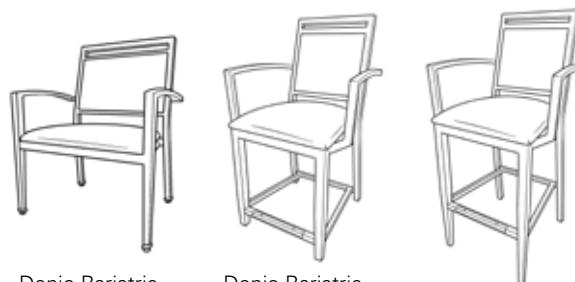
Denio Bariatric Dining Chair