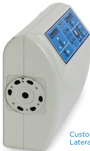
Customized Lateral Rotation