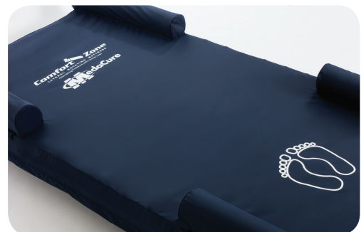
Side bolsters for optimum patient safety reduces the risk of falling.