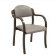
England Arm Chair