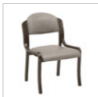
England Side Chair