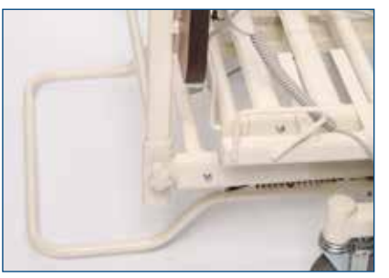
Included wall guard prevents bed from contacting wall and causing costly damage.