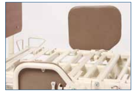
Two heavy-duty padded 3-position assist devices included.