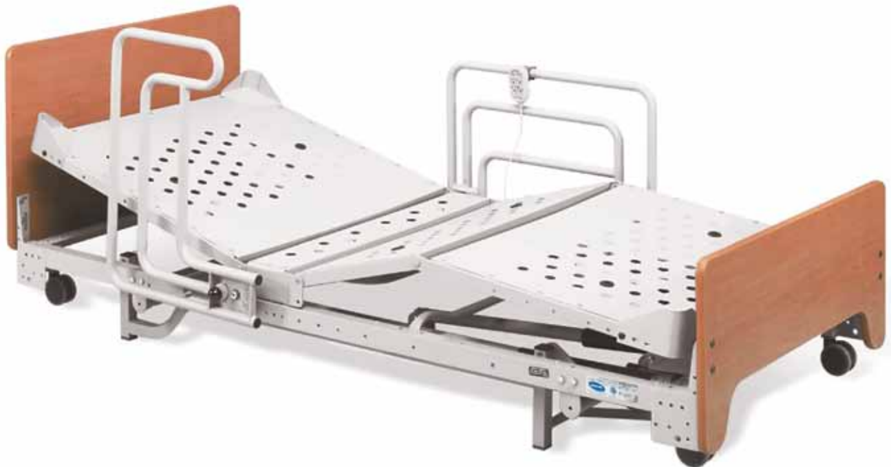
SHOWN WITH OPTIONAL PAN DECK

The SC900DLX is a full-function, full-feature, low-height bed that promotes quality resident care with full bed performance. Its three DC motors provide ultra-quiet operation of the head, hi-low and foot functions of the bed. Plus, the horizontal travel range of the SC900DLX is designed so that the bed will not damage walls during height adjustments.