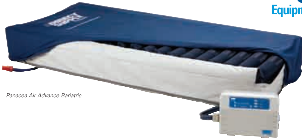
Panacea Air Advance Bariatric