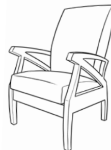
Silverthorne Occasional Chair