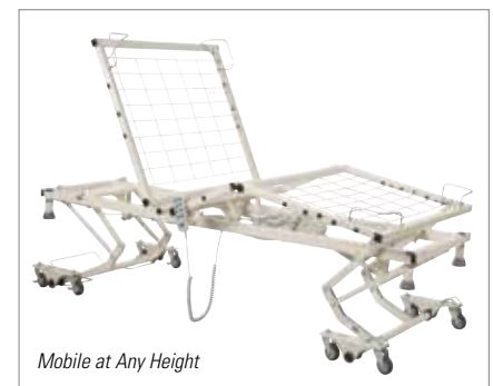
Mobile at Any Height