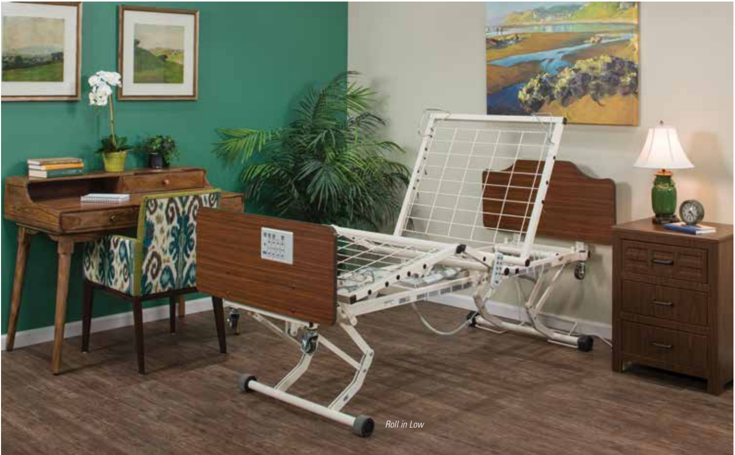
Roll in Low