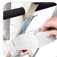
Quick Release Battery

WEIGHT CAPACITY: 600 Lbs. LIFTING RANGE: 37" - 68" high BASE WIDTH: Open- 38" / Closed- 22" BASE LENGTH: 41" BED CLEARANCE: 4.5" CASTER SIZE: Rear- 4" locking / Front- 3" swivel