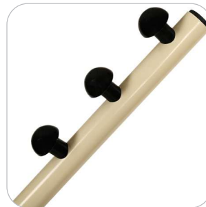
3 Oversized Locking Hooks on each side safely secures sling to lift