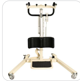
Adjustable Width from 22" - 38"