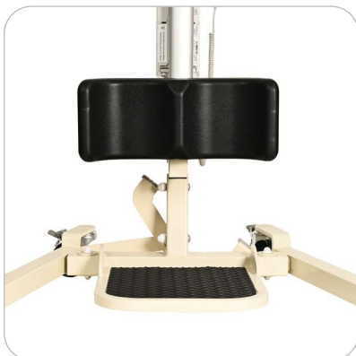
Padded Contoured Leg Support Adjustable to 4 height positions, comfortably secures legs in place.