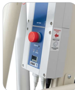
CPR Emergency Stop & Lowering Function