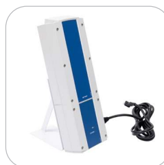
Optional Charging Base