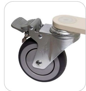
Rear Locking Casters Secures Lift in Place