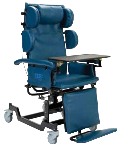
Shown as Height-Adjustable with Padded Footplate