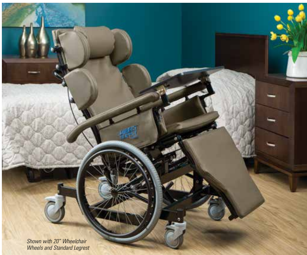
Shown with 20" Wheelchair Wheels and Standard Legrest