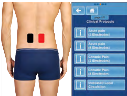
Educational Library with recommended electrode placement