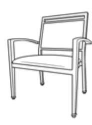
Denio Bariatric Dining Chair