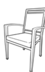
Denio Dining Chair