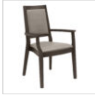
Dallas Stacking Arm Chair