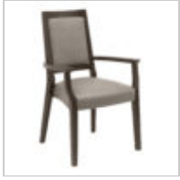
Dallas Accent Arm Chair