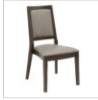
Dallas Stacking Side Chair