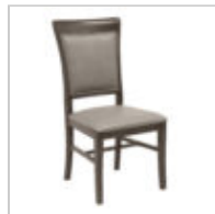
Remy Side Chair