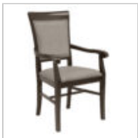
Remy Arm Chair