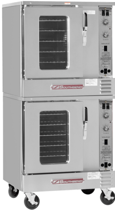
PCHG60S/S shown with optional casters