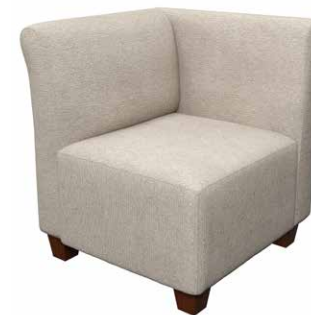
Bartlesville Left Curved Arm One Arm Chair