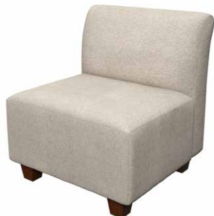
Bartlesville Armless Loveseat