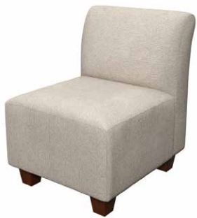
Bartlesville Armless Chair