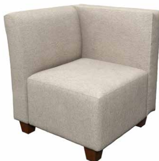
Bartlesville Left Straight Arm One Arm Chair