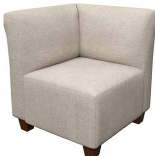
Bartlesville Corner Chair with Curved Arm