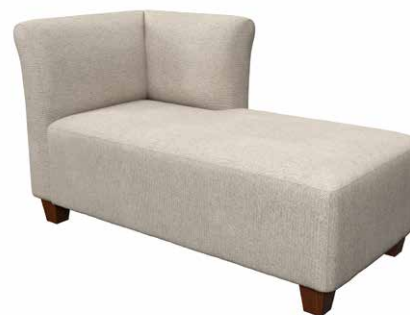
Bartlesville Left Curved Arm Chaise