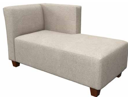
Bartlesville Left Straight Arm Chaise