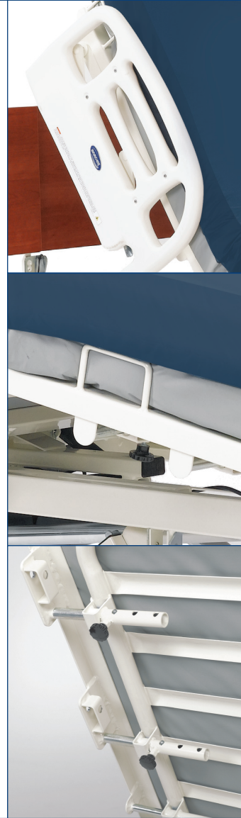
CS9 FX600 bed featured with Invacare® ThinkSoft® Positioning Device, Kendall Bed Ends and Invacare® Solace® Mattress

The innovative Carroll CS Series™ CS9™ FX600 Adjustable Width Bed adjusts from 36" to 39" or 42" to accommodate a variety of residents including those up to 600 lb., offering facilities the utmost in flexibility and providing a total solution for any long-term care facility.