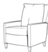
Oak Park Recliner