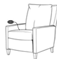
Oak Park Power Recliner