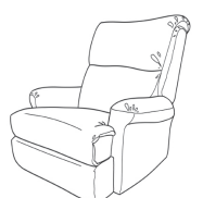
Cedarburg Manual Recliner