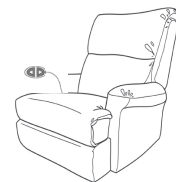
Cedarburg Power-Lift Recliner