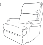
Cedarburg Rocker Recliner