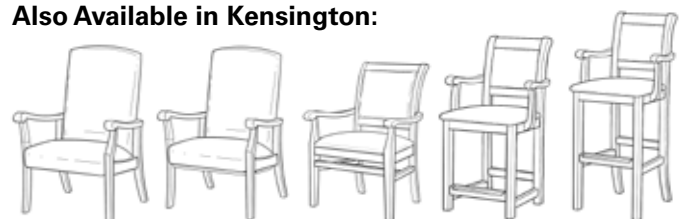
Kensington Occasional Chair Kensington Stationary Rocker Kensington Bariatric Dining Chair Kensington Counter-Height Stool Kensington Barstool