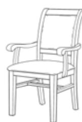
Denio Dining Chair