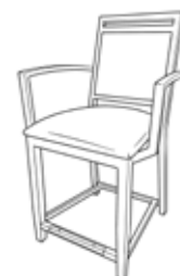
Denio Bariatric Counter-Height Stool