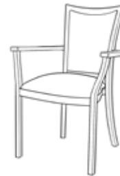
Huntsville Dining Chair