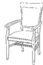
Surrey High-Back Dining Chair