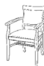
Surrey Low-Back Dining Chair