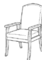
Williamsburg Occasional Chair