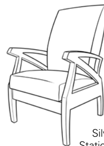
Silverthorne Stationary Rocker