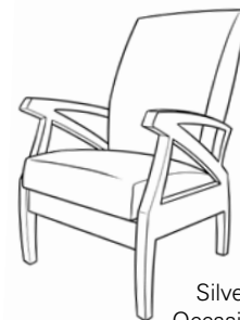
Silverthorne Occasional Chair